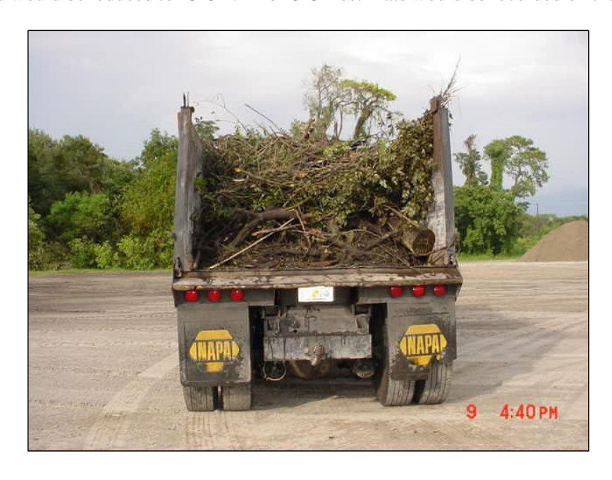
Lightly loaded truck without tail gate

Trailer lightly loaded – estimate at one half of measured volume. Example: if measured at 30 CY then the load would be reduced to 15 CY. The 15 CY estimate would be recorded on the load ticket.